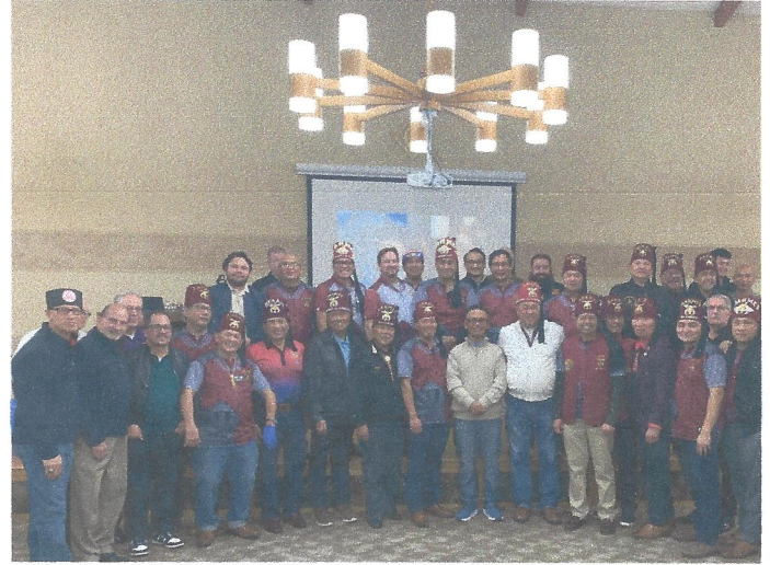
Aahmes Shriners night at Bay Cities Lodge