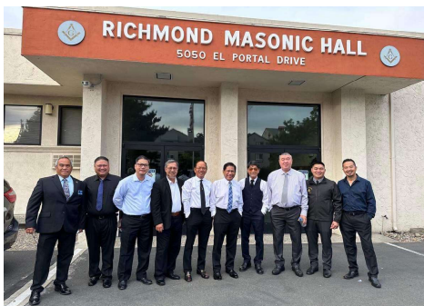
Bay Cities Officers preparing to travel to Salinas Lodge for a Courtesy Degree

The Bethel girls will be selling "Butterbraids and Cookie Dough" from November 1st to November 30th to help pay for our Grand Bethel & our Philanthropic Projects. Information will be posted on the Lodge's Facebook page website. Thank you for your support!