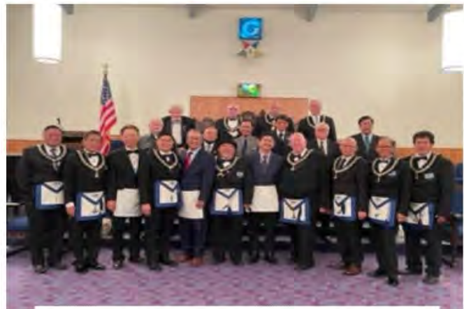
One of two 2 nd Degree Conferrals in June Just one of the amazing events we've had!

Mission Bell Chapter No. 205 OES ALL DARK IN JULY