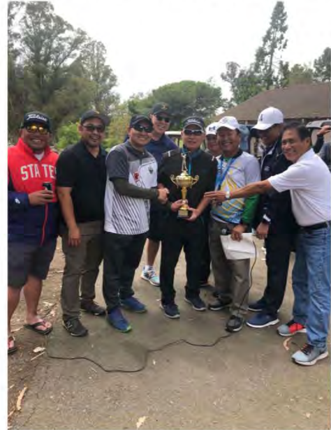
Our Trophy winners @Fellowship at the Greens