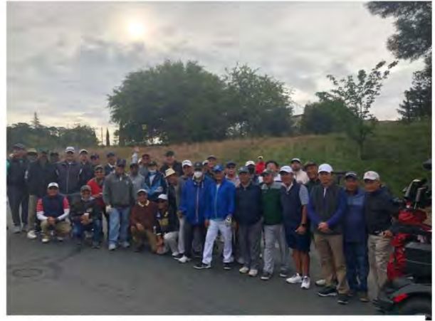
Bay Cities welcomed 56 participants, 8 to 9 Bay Area lodges present & raised $3,050 for Masonic Charities and our Job Daughters