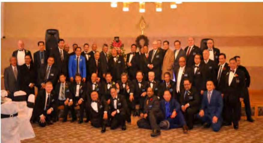
Stronger still & growing