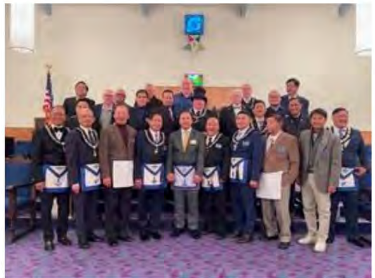
Brethren at the Last Stated Meeting of 2022