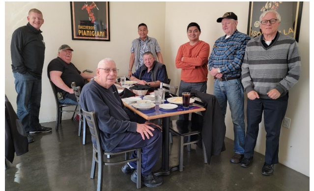
Three Brothers from Bay Cities Lodge joined our High Twelve members for fellowship on March 14.

ALL PROCEEDS TO BENEFIT THE ORGANIZATION'S FRATERNAL PURPOSES