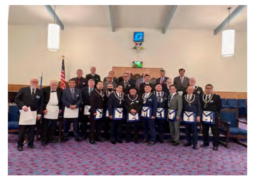
Great attendance at January's Stated Meeting

@ 510 829-5333 / mmvalencia85@outlook.com or @ 510 322-1800 / abnerlumabas@gmail.com