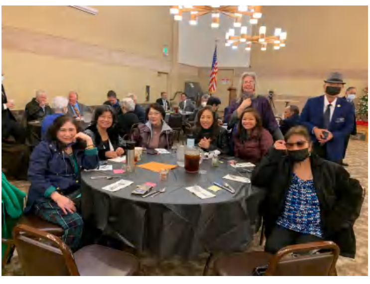
So pleased to see our lovely ladies & their numbers increasing at Stated Dinners